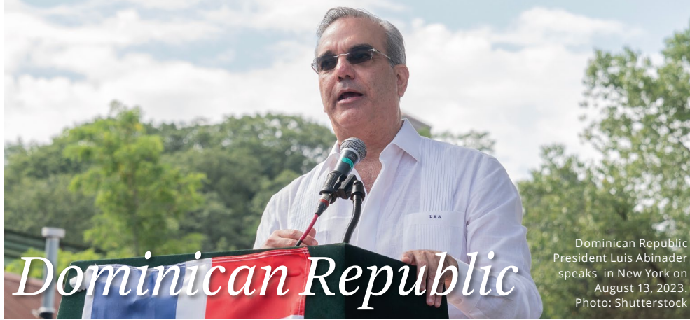
Dominican Republic President Luis Abinader speaks in New York on August 13, 2023.